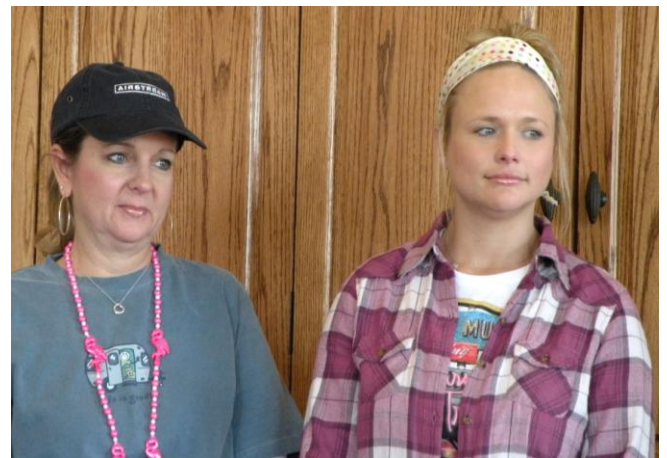
Who said Airstreamers are a bunch of old fogeys?

Tue, March 1: Unit Lunch at South Luby's located at US 290 & Brodie Lane