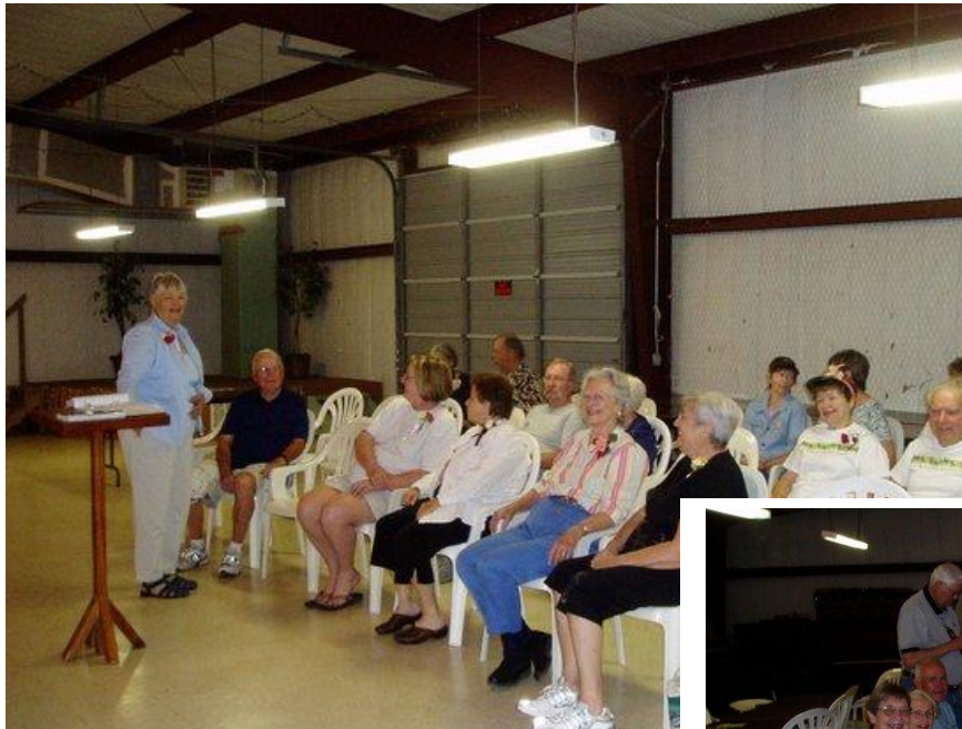
Devotions on Mother's Day Fredericksburg May Rally

Reservations: 512.266.1562 www.camperresort.com