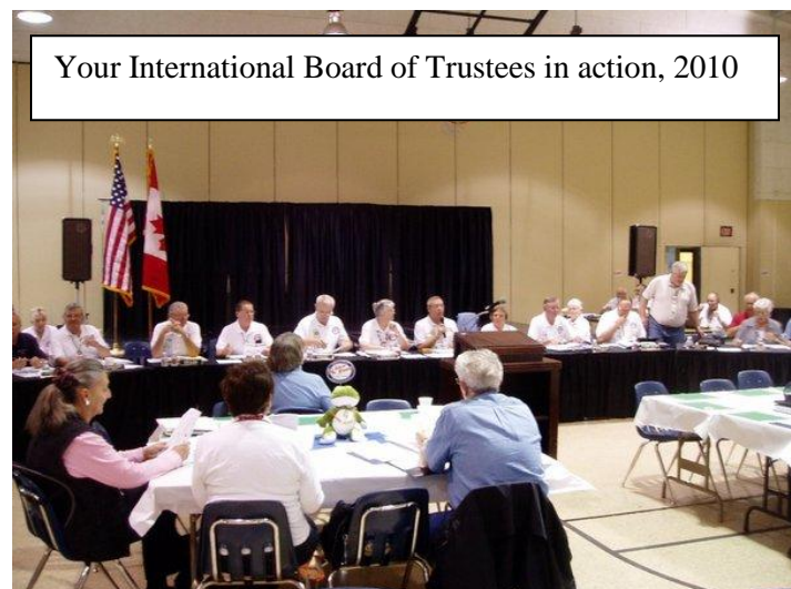
Your International Board of Trustees in action, 2010