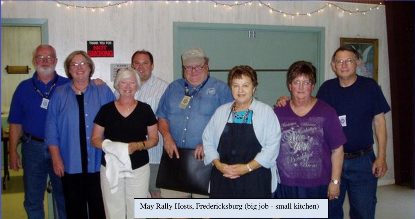
May Rally Hosts, Fredericksburg (big job - small kitchen)