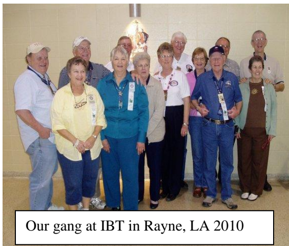
Our gang at IBT in Rayne, LA 2010