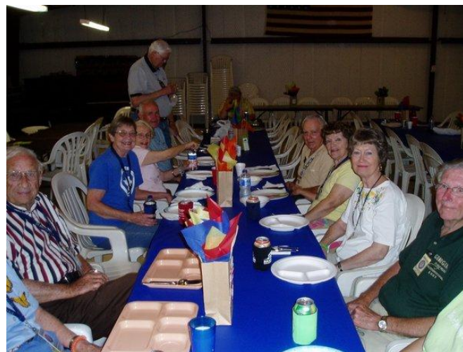
Ready to eat – again!