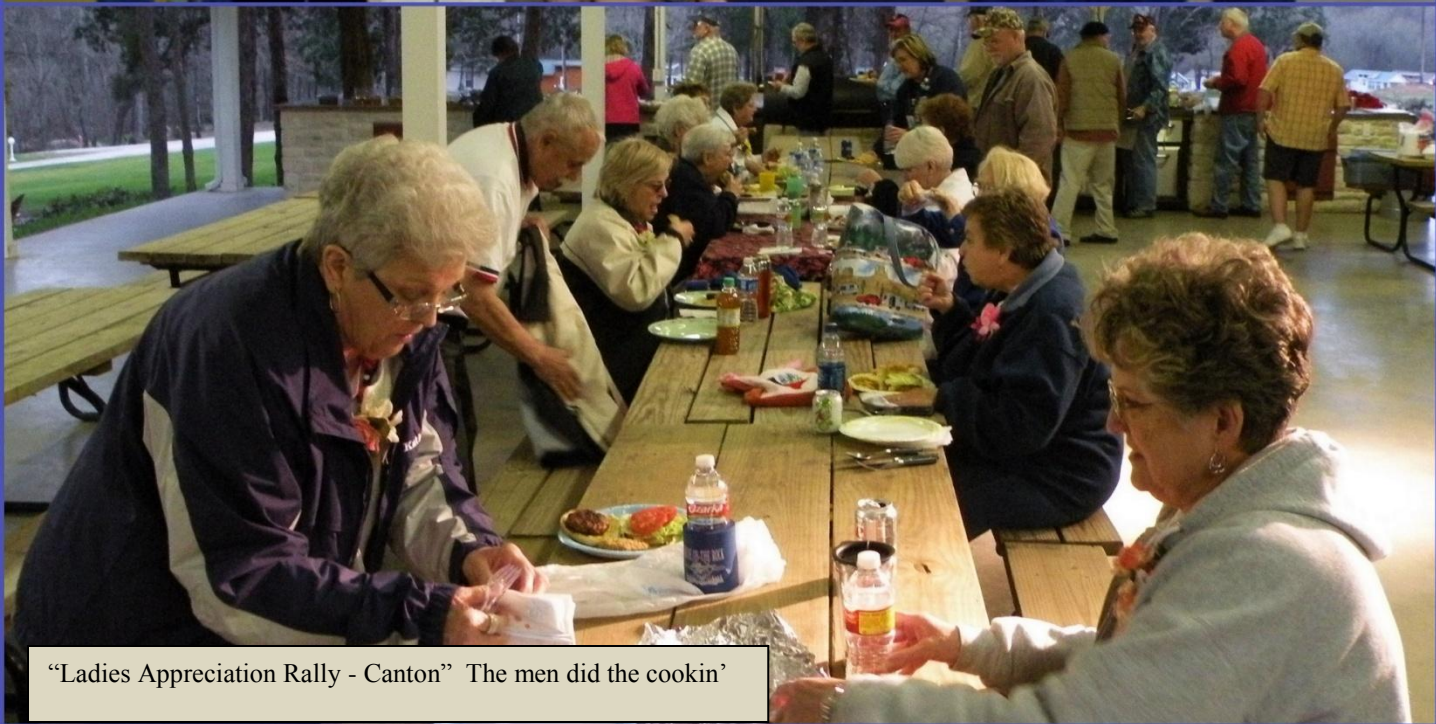
"Ladies Appreciation Rally - Canton" The men did the cookin'