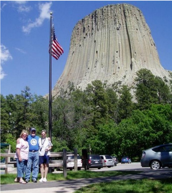
2010 WBCCI International Rally at Gillette, WY