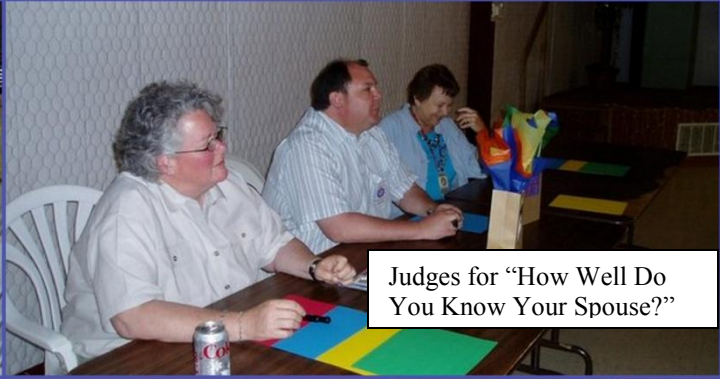
Judges for "How Well Do You Know Your Spouse?"