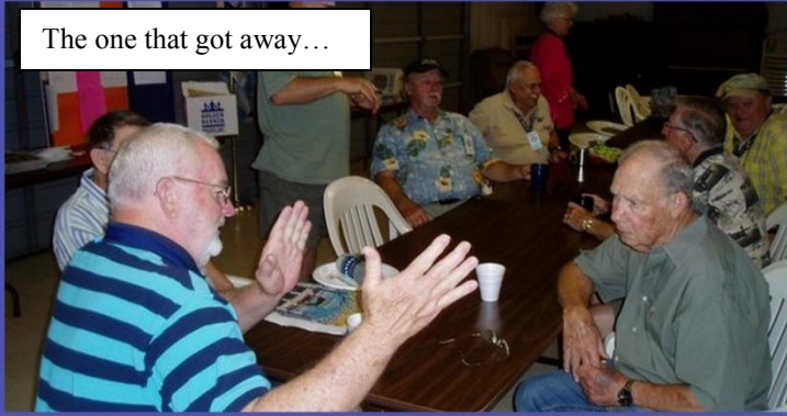
The one that got away...